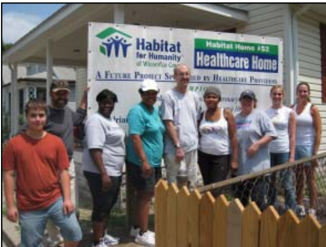
The morning crew with the future homeowner!