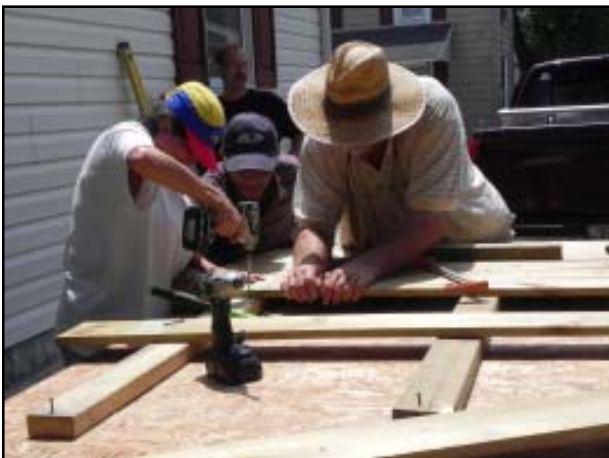
Teamwork, volunteers and power tools.